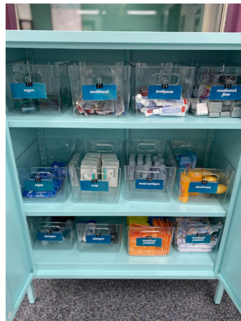
Comfort Cabinet, located on the Lower Level.

Often it’s the most basic hygienic essentials that are hard to come by when economic times are tough. With no questions asked, we are offering some of these supplies, at no cost, in our Comfort Cabinet. Here you can find toothpaste, toothbrushes, deodorant, soap, menstrual products, shampoo, and several other necessities.