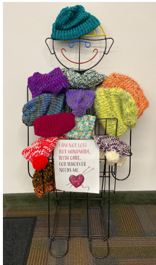
Hats and scarves, located on the Main Level.

Before the long cold winter months hit us, the Knit and Crochet group are very busy using their yarn and talents to make free handmade hats and scarves. Every year this fun face finds its way